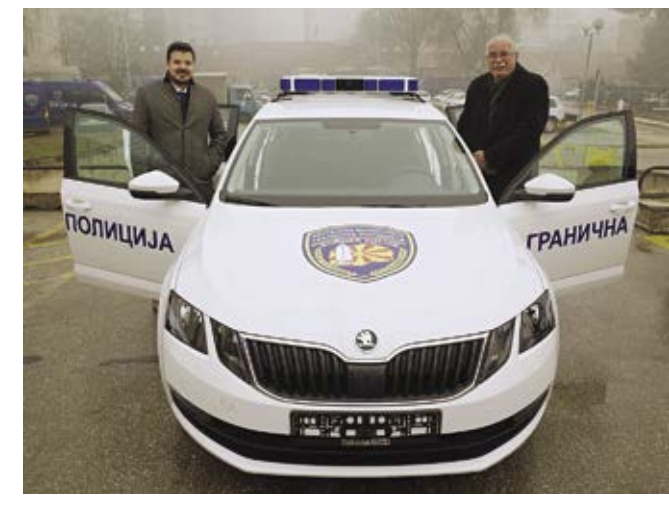
The Macedonian border police received 45 Škoda Octavia cars.

Implementation of the second part of the donation will run until the end of 2018. With a contribution from UNHCR, the Macedonian Ministry of the Interior has been developing a new asylum database. The hardware necessary for smooth operation of the new database will be purchased with the funds from the Czech Republic. Based on a tender procedure, new servers, computers and other equipment will be purchased by the end of 2018.