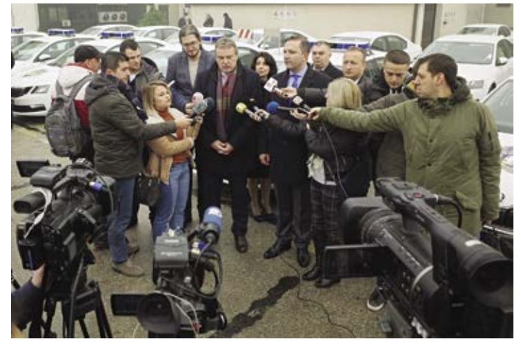
Official handover of vehicles to the Macedonian border police was accompanied by a great interest of the media.