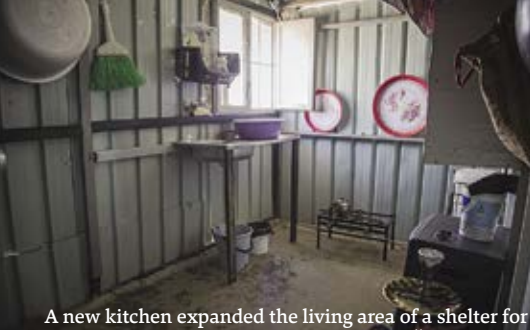
a family of five. ©MoI CR (Photo: Štěpán Lohr)